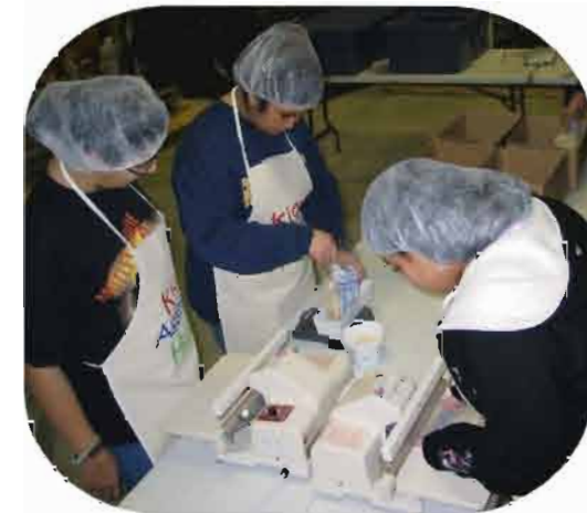
The packets are weighed and sealed.