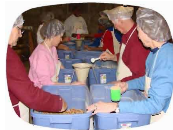
Adults and youth measure and pour the ingredients into uniform plastic packets.