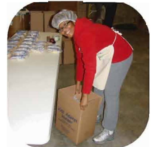
Cartons are packed and taped, ready for shipment.